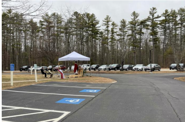
WORSHIPING IN CARS