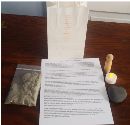
LENT IN A BAG