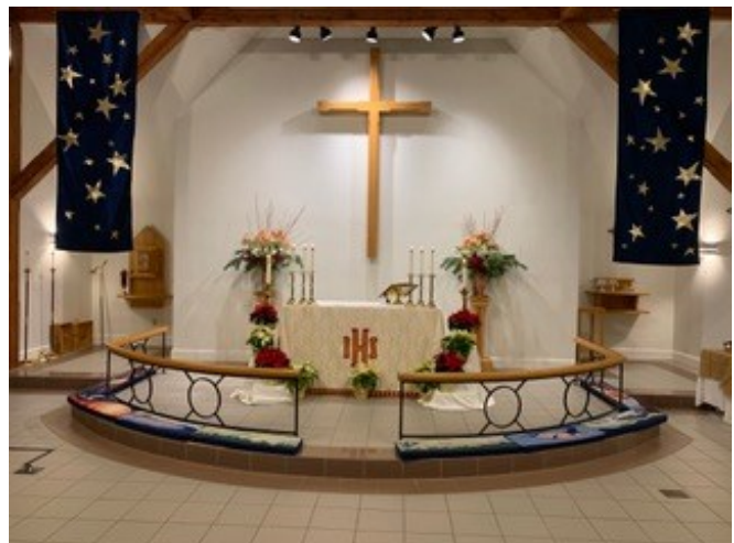
Christmas Eve Service at St. David's. The Altar Guild and Flower Guild at their best