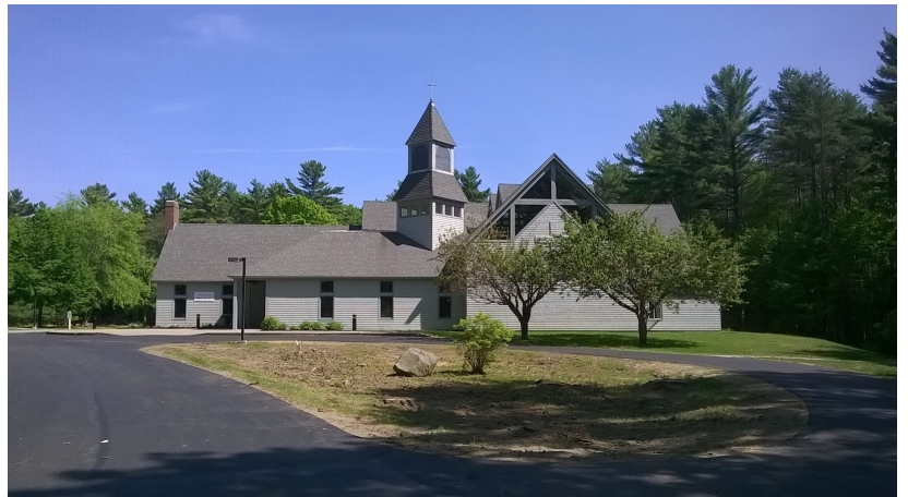
St. David's new look from Route 1. More open and accessible to folks driving through.