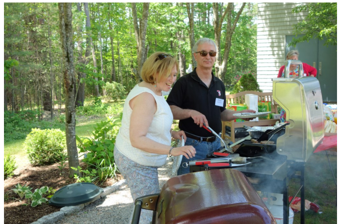
Outdoor Service and Parish Picnic, June 2018